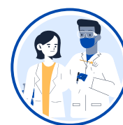
Medical Lab Technicians/ Technologists