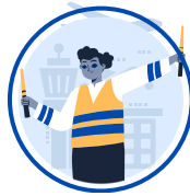
Air Transport Workers

Lower risk of COVID-19 infection may be due to outdoor work, well-ventilated environments, use of respiratory protection, or minimal physical proximity and contact with others (e.g. remote work).