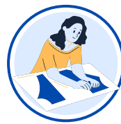
Textile Fabrication Workers