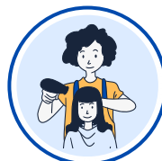
Personal Services Workers