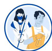
Janitors and Cleaners