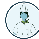
Chefs and Cooks