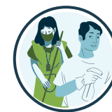
Janitors and Cleaners