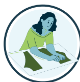
Textile Fabrication Workers