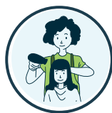
Personal Services Workers