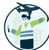
Air Transport Workers