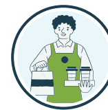
Food and Beverage Preparation Workers