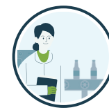
Food and Beverage Processing Workers