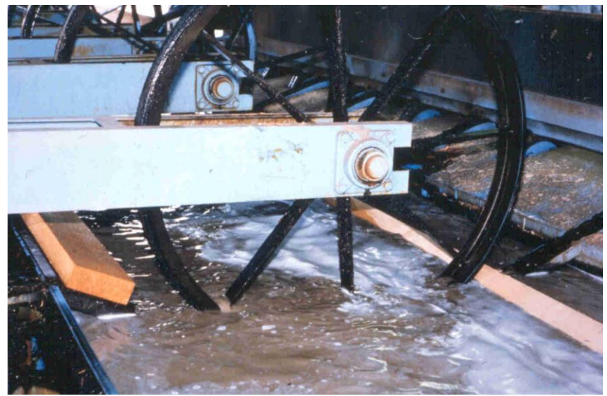
Towards a cancer-free workplace